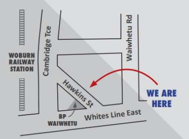
18 Hawkins St, Lower Hutt