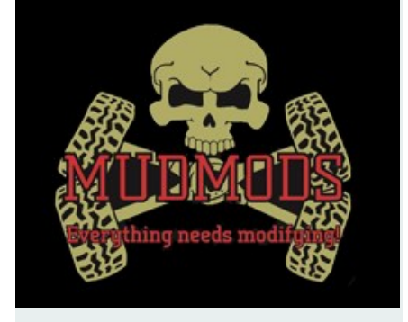
MudMods | 4x4 & Offroad Vehicle Modification & Fabrication Wellington