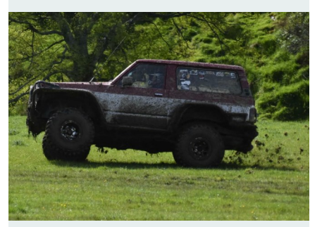
Hintzy - Speed section