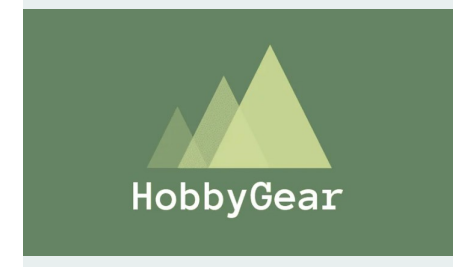
4x4 - Hobbygear.co.nz